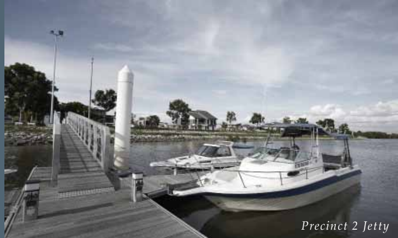
Precinct 2 Jetty