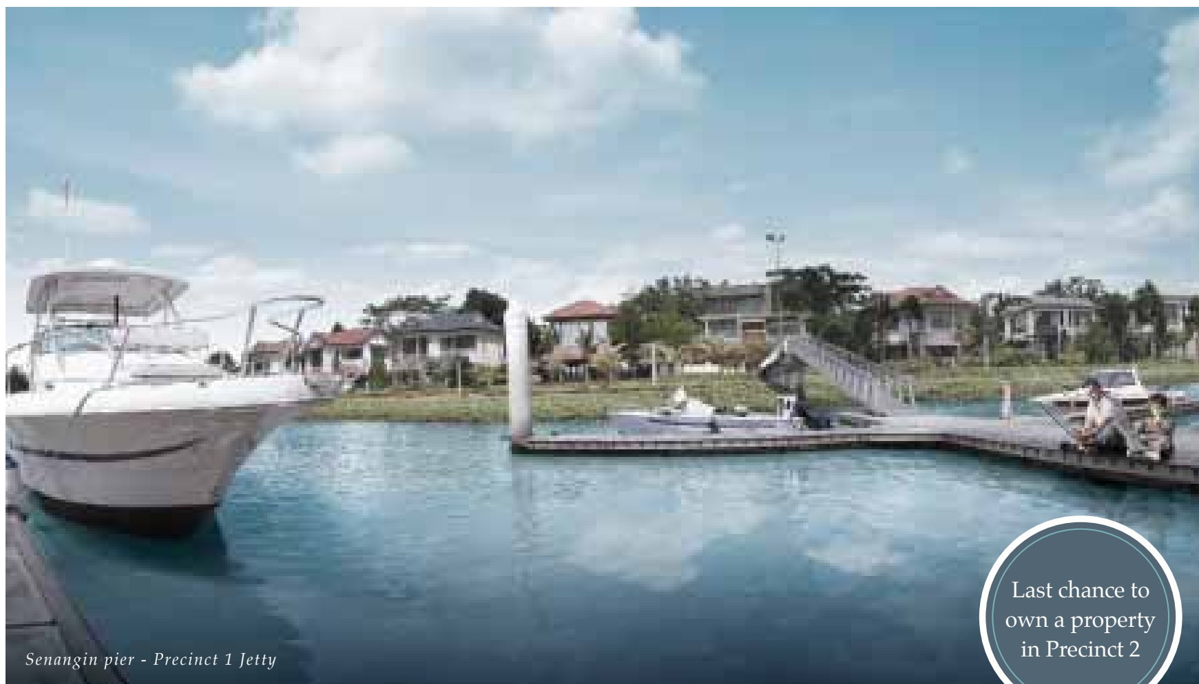
Senangin pier - Precinct 1 Jetty

Living in Glenmarie Cove injects a fresh perspective towards suburban living with its riverfront resort-style living and generous proportions of fresh greenery, it is the idyllic setting to raise a perfectly happy family.